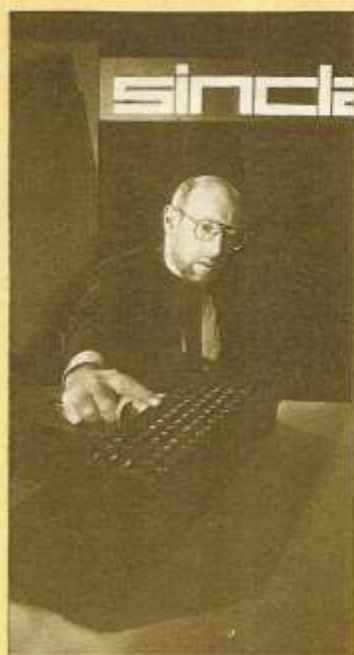
Reaching into the future!