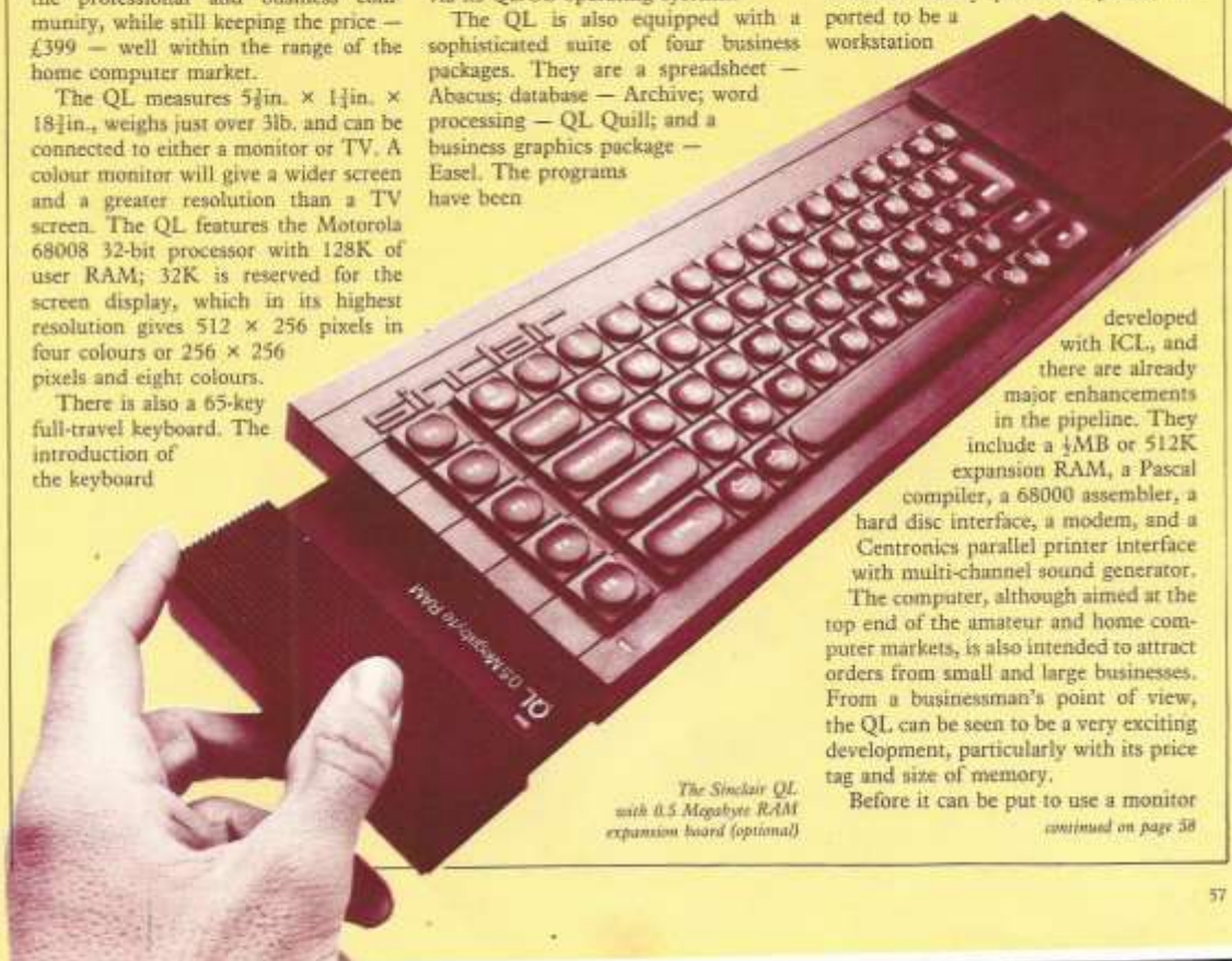
The Sinclair QL with 0.5 Megabyte RAM expansion board (optional)