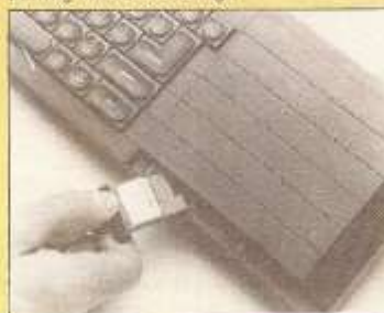
Inserting Microdrive cartridges

The suite consists of a word processor, a spreadsheet, a database and a business graphics program. They are integrated in style, structure design and perhaps most important in the sharing of information. The last feature allows data to be transferred between programs