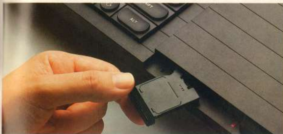
Sinclair Microdrive cartridges – up to 100K of programs and data on a medium so compact you can pop it into your pocket.