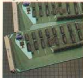
Compact expansion boards.

The units range from 64K and 128K RAM boards to massively powerful 256K and 512K RAM boards, so there's something for every user.