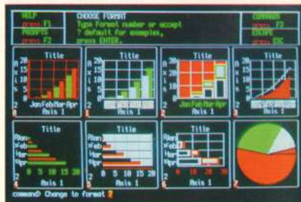
The QL's superb graphics capabilities – as demonstrated by the Sinclair Vision QL monitor.

It's available from MBS Data Efficiency on 0442 60155 and selected Sinclair stockists.