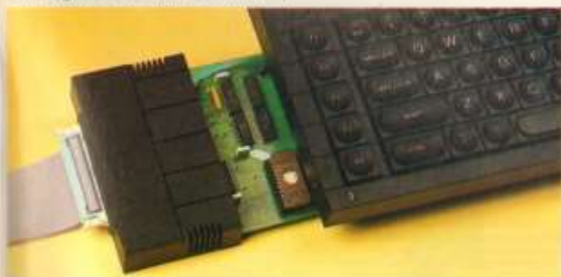
A Centronics interface slips discreetly into place.

And that's just the beginning. For attaching scientific and laboratory instruments to the QL, CST even offer an IEEE-488 interface, which can handle up to 16 connected devices simultaneously!