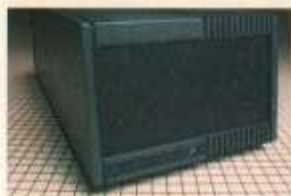
Winchester hard disk drives supplement your QL's built-in mass storage.

The Firefly will be available very shortly from Quest on 04215 66488.